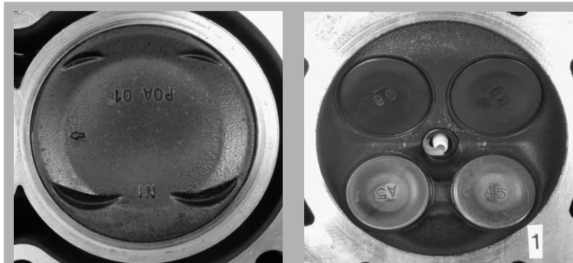
Honda piston and cylinder head upon completion of JASO CCD test with Cen-Pe-Co Gas-O-Klenz's detergent technology.

Cen-Pe-Co Gas-O-Klenz removes combustion chamber deposits, allowing the engine to operate more efficiently for better fuel economy.