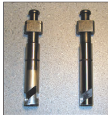
Untreated With Additive